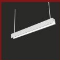
PENDANT SWIVEL PENDANT