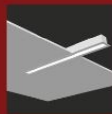
FLANGED PLASTER FLANGED TRIMLESS